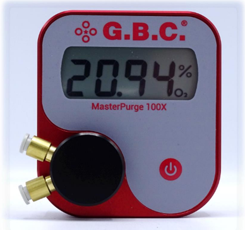
Robust aluminium enclosure and enlarged LCD display make the MP100X extremely user friendly.

GBC's MasterPurge 100X Weld Purge Monitor is a high quality, simple to operate handheld gas analyser measuring oxygen content in weld purge operations down to 0.01% O 2 content (100PPM). Housed in a machined aluminium case, the MP100X is a robust, reliable, and revolutionary product suitable for most weld purging operations on stainless steel, duplex, super duplex and other alloy steel materials.