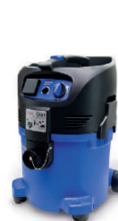
Dust Extraction Unit