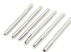
Bushes for short electrodes