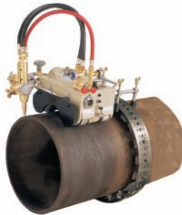
with Guide Band