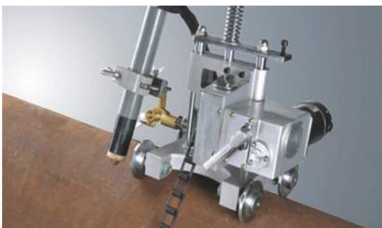
Motorised plasma cutting version

A manual chain driven pipe cutting machine that provides smooth, accurate cutting action by incorporating a low gear ratio and worm gear drive. Cuts 5 - 50mm wall thickness on pipe with 114 - 600mm (4" - 24") diameter. Beveling head angle can be set quickly and accurately by scale on a rack and pinion. This complete package is supplied together with a 2.4m length of guide chain and a selection of ANM cutting tips. Solidly constructed using brass, chromed and stainless steel parts.