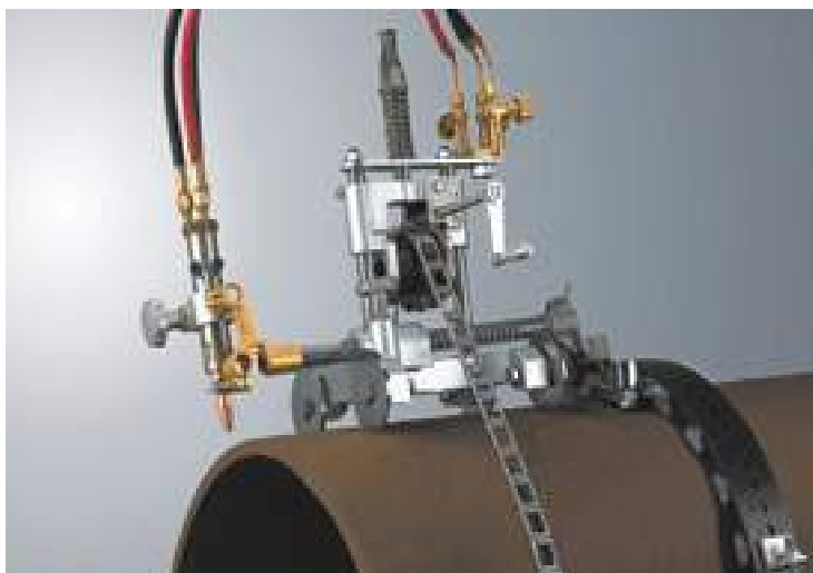
Guide Band ensures accurate square cuts