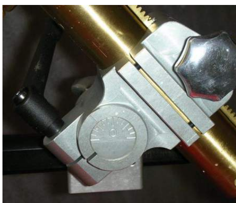
Adjustable torch holder

Available in manual or motorised versions. Motorisation kits can be fitted retrospectively.