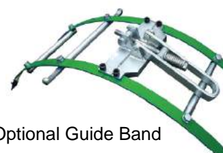
Optional Guide Band

The GB CUT F1 can cut & bevel pipes from 4" to 80" diameter. The torch is mounted in a holder which can be adjusted through 3 axes for perfect positioning. Triplex link chain and adjustable wheel positions enable the GBC CUT F1 to perform precise, square cuts.