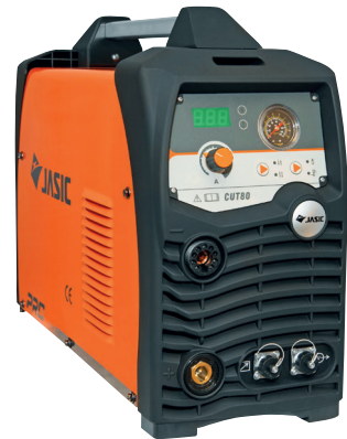
Jasic Plasma Cut 80