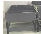
Extension Sheet Support (optional)