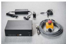
Electronic Control Unit and Cables