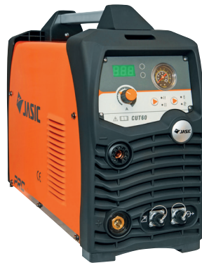
Jasic Plasma Cut 60