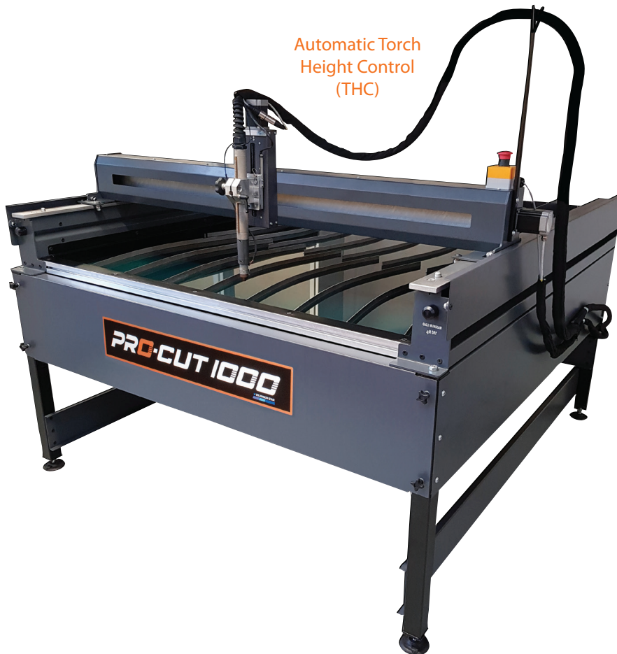
Automatic Torch Height Control (THC)

Our Torch Height Control system adjusts the torch height thousands of times per second to maintain a precise distance between the plasma torch tip and material being cut, ensuring on thinner material which are warped you will still experience smooth edges, sharp detail and precision cuts.