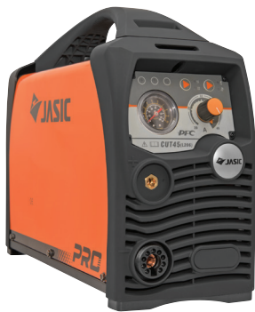
Jasic Plasma Cut 45

For optimum cutting performance, we have partnered the Pro-Cut Table with the Jasic Inverter Plasma Cutting Machines. We offer a choice of 3 Jasic Plasma cutters with a table cutting capacity of up to 20mm to ensure you get the right Plasma machine to suit your needs. With proven reliability, performance and backed up by a 5 year warranty we guarantee peace of mind cutting.