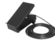
Foot Control Unit JFC-08