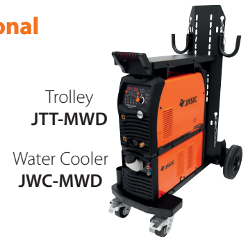
Trolley JTT-MWD Water Cooler JWC-MWD