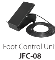
Foot Control Unit JFC-08