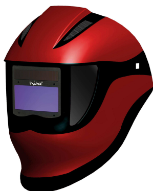
Welding Helmet PL-2B01/2013

The CR-2B01/2013 is manufactured under ISO 9001:2000 Quality System.