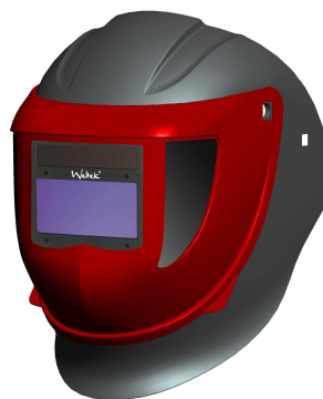
Welding helmet GT-2B01/2013