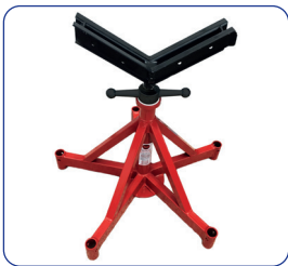
PN 3500 Five Leg Giant Jack (jack only and V-head)