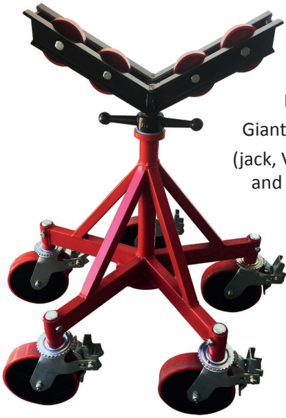
PN 3510 Giant 5 Package ST (jack, V-head, casters and steel wheel)