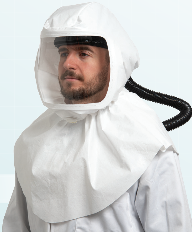
Image shows re-usable hood

Available in 2 systems both featuring the Airkos® Blower Unit but with a choice of hood. The Softek hood is a flexible headtop in re-usable (PU) material or disposable (TPU) material. The Softek hood is equipped with adjustable headgear in width, height and angle for perfect ergonomics as well as a front air duct for a smaller airflow inside.