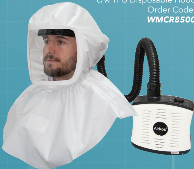
Weltek Medical System c/w TPU Disposable Hood Order Code: WMCR8500