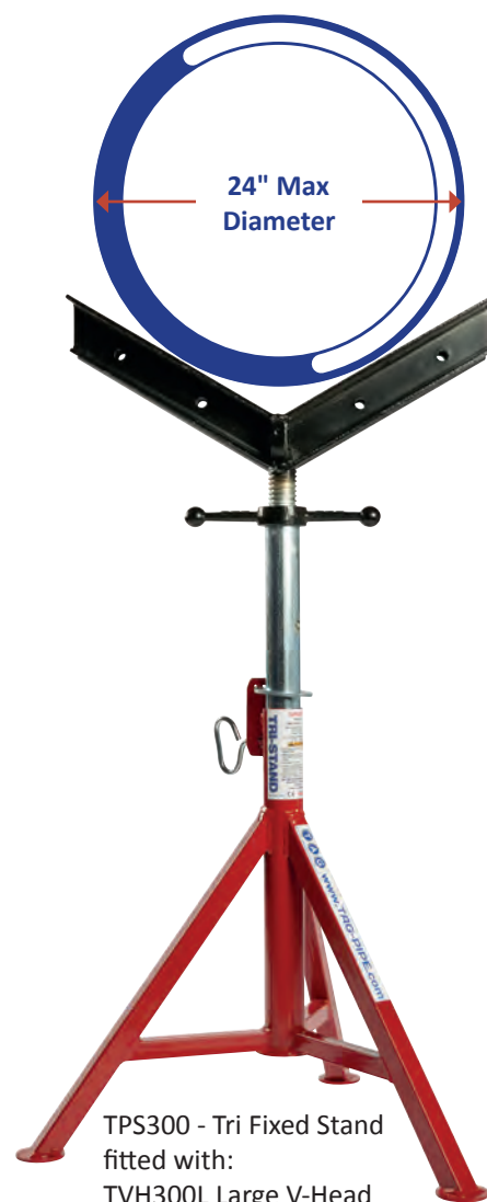
TPS300 - Tri Fixed Stand fitted with: TVH300L Large V-Head