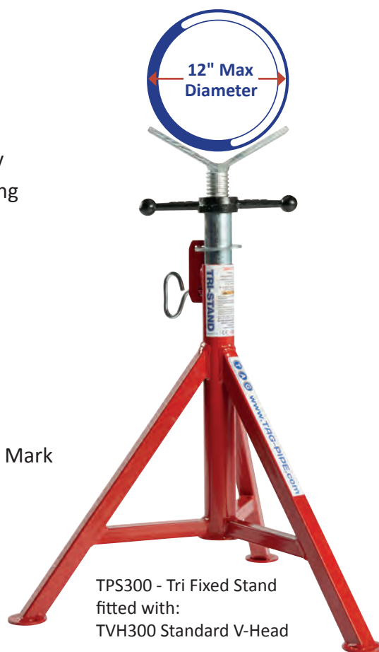
TPS300 - Tri Fixed Stand fitted with: TVH300 Standard V-Head