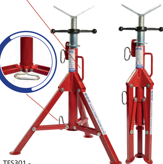
TFS301 - Tri folding stand shown open and closed