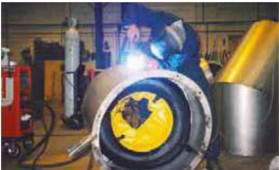
Speedy Purge used to weld a stainless steel elbow.