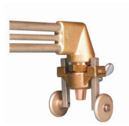
Roller Guide TJ1602