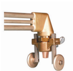
Roller Guide TJ1602