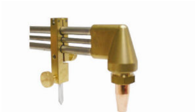
Pivot Guide - TJ111535